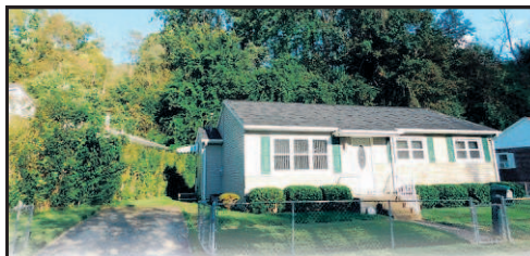
1005 Midway Drive, Dunbar $99,900 2:00-4:00 PM