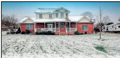
29 Florence Farley Lane, Fraziers Bottom $304,000 2:00-4:00 PM