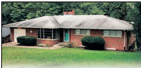
1531 Bedford Road, Charleston $269,900 2:00-4:00 PM