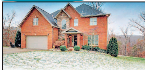
82 Rockcrest Drive, South Charleston $410,000 2:00-4:00 PM