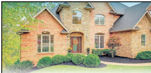
6009 Pinnacle View Drive, Hurricane $684,500 2:00-4:00 PM