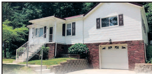
605 Charmac Drive, Charleston $94,900 2:00-4:00 PM