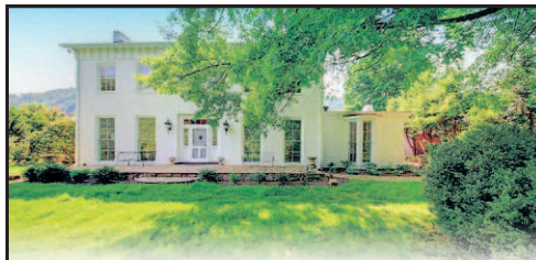
6560 Roosevelt Ave., SE, Charleston $399,900 2:00-4:00 PM