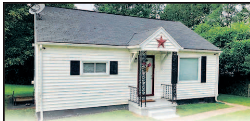
405 Lore Street, Saint Albans $79,900 2:00-4:00 PM