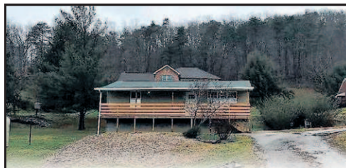
8124 Dingess Avenue, Hamlin $78,900 2:00-4:00 PM