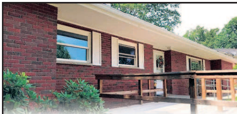
5241 Sun Valley Drive, Cross Lanes $140,000 2:00-4:00 PM