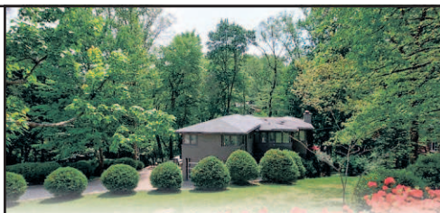
68 Abney Circle, Charleston $429,900 2:00-4:00 PM