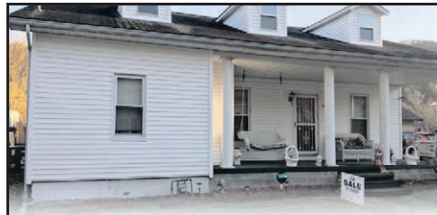
2210 Robin Avenue, East Bank $90,000 2:00-4:00 PM

9 Rooms 2 Bedrooms • 2 Baths 1,357 sq.ft. DIRECTIONS: Turn off Rt. 61 before the Dollar Store on Walnut St. Go across tracks at Pryor Funeral Home. Go to end of street and turn right. First White House on right.