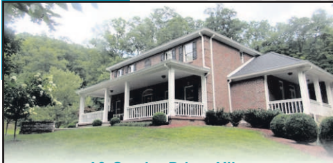
68 Crosby Drive, Nitro $895,000 2:00-5:00 PM

5 large BR, 6.5 lavish BA over 6,800 sq ft. incredibly landscaped grounds with architecturally designed terraces porches & patios. $350k in upgrades since 2013 - gated subdivision near lake - quartz counters in kit & bathroom - Bone china backsplash from Italy. Steam room, 1st fl mstr suite - media room w/ 8 seats & projector screen - custom kitchen, hardwoods & granite. 4 en suites, 3 tiled porches, 2 kitchens! Multi-million dollar neighborhood 10 mins from Charleston.