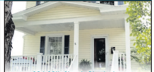
304 20th Street, Charleston $235,000 2:00-4:00 PM

Olde world charm w/modern conveniences. Updated kitch, master suite & baths. Beautiful HRWDS & wainscoting. 4 fireplaces, wide baseboards & crown. Dramatic stair case & inviting foyer. Perfect flr plan for entertaining. Walk-up attic for easy, extra storage. River views from covered front porch. Sellers offering Greenbrier pool stock. Motivated seller. DIRECTIONS: MacCorkle Ave 19th St exit, near UC Circle around the block, 20th St is a one way, house on LFT