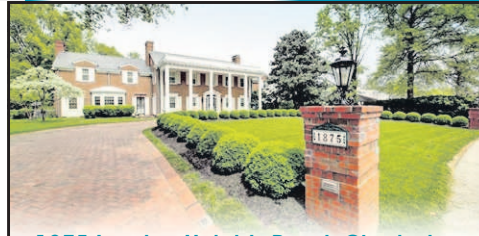
1875 Loudon Heights Road, Charleston $890,000 2:00-4:00 PM

Imagine yourself at the Greenbrier Resort in this magnificent home in the heart of much desired South Hills area, with beautiful terraced grounds & views of the city and hills sitting on 1.4 acres. A large outdoor pool to sit around or relax in. Hardwood floors, butternut woodwork, high ceilings, slate roof & copper gutters with a huge heated/cooled four-season sunroom. 5 bedrooms, 5 1/2 baths, basement & garage. Very elegant - a must see!