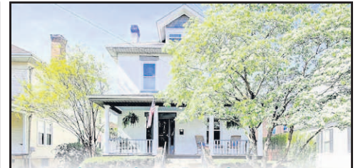
1407 Lee Street East, Charleston $224,000 2:00-4:00 PM

Wow! Wonderfully updated East End home! Updated roof, windows, kitchen, bathrooms with all the original charm and character of the neighborhood! Refinished space on 3rd floor could be 4th bedroom or great playroom! Wood-burning fireplace. Plus one of the best closets on the East End DIRECTIONS: Take Kanawha Blvd e to Ruffner Ave. Go 3 blocks and turn left on Lee St. To 1407 on the left.