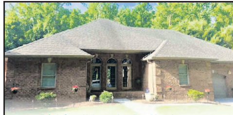
134 Southbrooke Dr, Hurricane $334,500 • NEW TIME 3:00-5:00 PM

Stop by before kickoff & see this beautiful brick home. This 2005 property offers almost 2,700 sqft, 4 BR, FLAT yard, 2 car garage, new kitchen appliances, newer HVAC (has 2 units) one replaced, new deck 2018, propane gas fireplace, professionally painted. Master has HUGE walk-in closet & bath & a private office. Hurricane school district, close to everything. To view more pictures & full details text SEE17481 to 878787 OR visit https://134southbrookedrive.utour.me