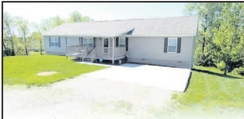
48 Antioch Road, Red House $214,900 2:00-4:00 PM

This 4 bedroom / 2 bath home is located in the scenic Red House area and offers many features. It has an open concept, stainless steel appliances, large back deck, large front porch, full-size unfinished basement, large master bedroom with ensuite situated on 3 acres. This is a must see! DIRECTIONS: From Winfield, cross Ross Booth Mem. Bridge, R on Rt 62 to L on Rt 34 (McClain Pike), follow Rt 34 4.8 miles to R on Antioch Rd, second house on R.