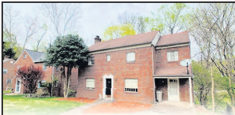
405 Fairview Drive, Charleston $189,900 2:00-4:00 PM

Tons of character & charm nestled on a quite & delightful street. Beautiful hardwoods. Newly finished basement space w/ walk-out patio area. Great deck w/ covered section for comfortable outdoor living space great for entertaining. Master bedroom w/ original en suite. Great closets. Desirable location, close to downtown. DIRECTIONS: West Washington, turn onto Edgewood Drive. Left onto Stonewall. Left onto Summit, left onto Fairview. House on left.