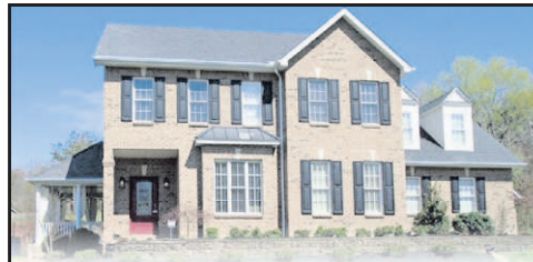
1013 Crestmont Road, Hurricane $525,000 2:00-4:00 PM

All brick in a gated community, new saltwater pool, new outdoor bar and grill, koi pond and hot tub. Separate outbuilding with heat and air and lots of storage. Fenced backyard with a lot of room for entertaining. Butlers pantry off kitchen. DIRECTIONS: Teays Valley Road to Cow Creek, go under the interstate, turn right into Woodridge Estates. Home is on the left.