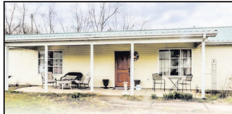
78 Sandstone Circle, Buffalo $190,000 2:00-4:00 PM

Four bedroom rancher on level lot. Minutes from the Toyota Plant. Large bathrooms, walk-in closets in every room, beautiful library with custom built-ins. Peaceful setting, enjoy your evenings watching the sunset from your screened in back porch or patio. DIRECTIONS: Rt 62 to Buffalo, Turn right onto Kapps Lane, Turn right onto Sandstone Circle.